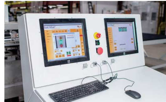
True CNC Control System