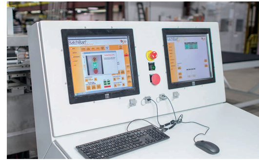
True CNC Control System