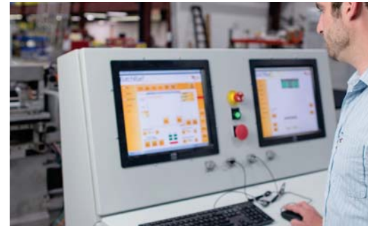
True CNC Control