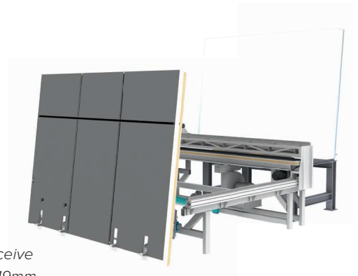
Tilting to Receive Glass up to 19mm