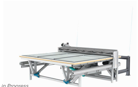
Cutting in Progress Followed by Manual Breakout