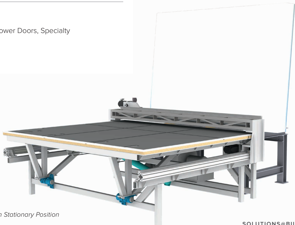
TCB 1150 Shown in Stationary Position

More Key Advantages and Outstanding Features >