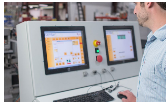
True CNC Control System