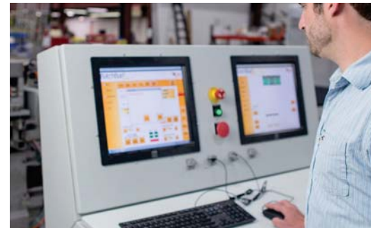
True CNC Control System