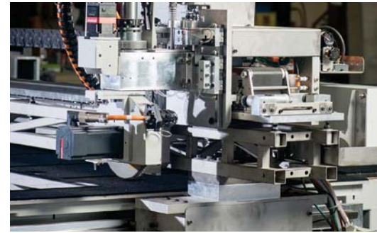
Z-95 Cutting Head with Edge Delete