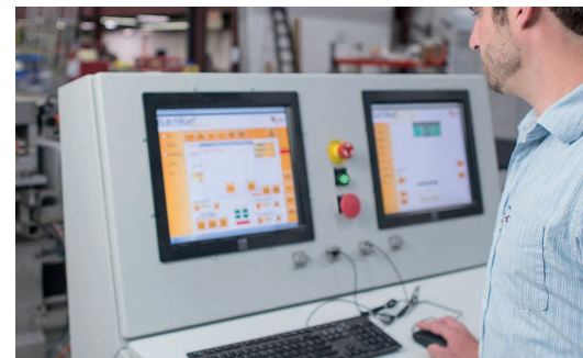
True CNC Control System