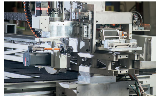
Z-95 Cutting Head with Edge Delete