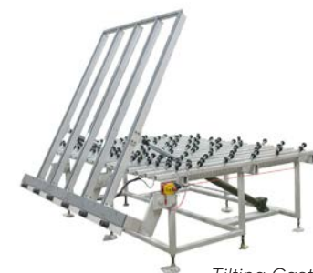
Tilting Caster Table