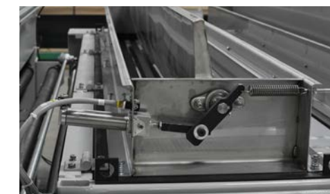
Automatic Louver System