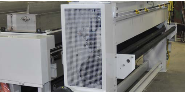
Nip Roll Press following Main Oven