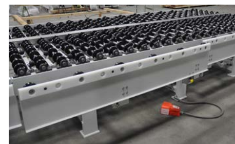
Slide In/Out Roller Decks