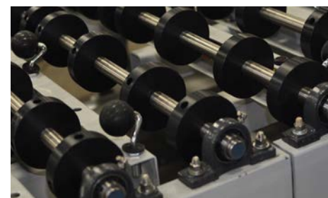
Pop Up Caster Deck