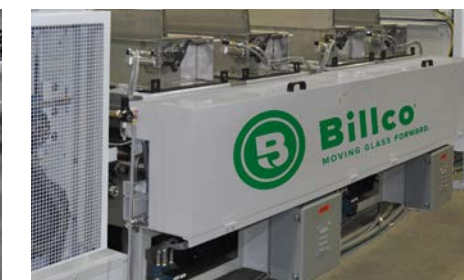
Laminating Ovens and Nip Roll Presses