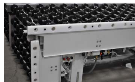
Drop Down Deck