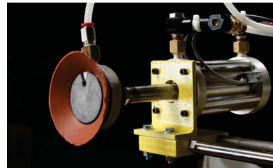
Non-Marking Vacuum Cup