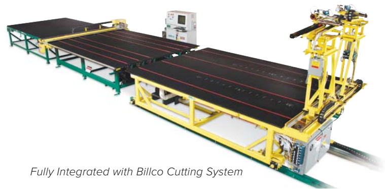
Fully Integrated with Billco Cutting System