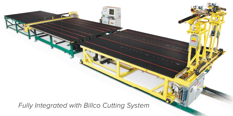
Fully Integrated with Billco Cutting System