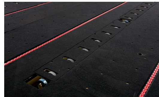
Automatic Squaring and Conveying