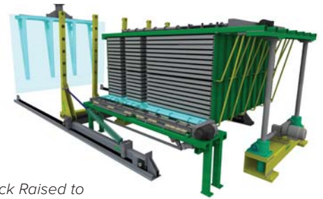
Storage Rack Raised to Receive Remnant From the Cutter