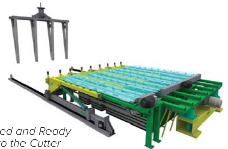
Glass Loaded and Ready to Convey to the Cutter