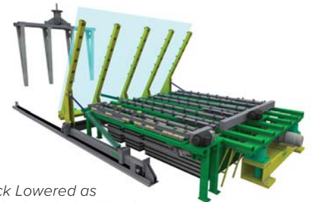
Storage Rack Lowered as the Tilt Loader Loads the Next Lite