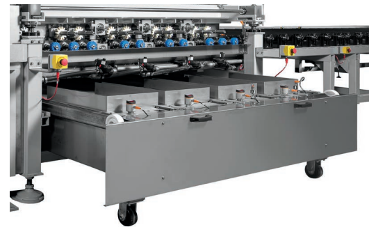
Roll Out Tank Cart