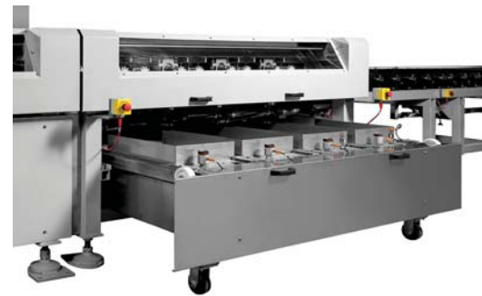
Roll Out Tank Cart