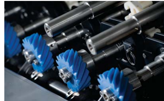
Helical Gear Conveyor Drive System