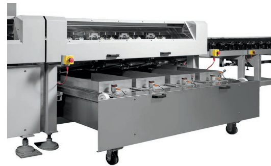
Roll Out Tank Cart