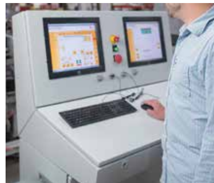
True CNC Control