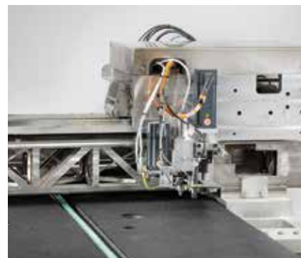
Powerful Cutting Head