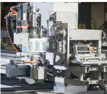
Z-95 Cutting Head with Edge Delete