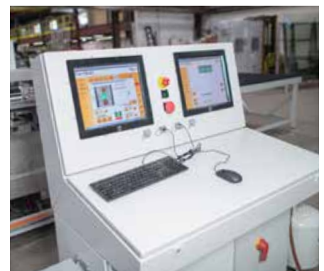
True CNC Control System