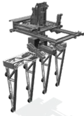
Extended Grab for Jumbo Sized Glass