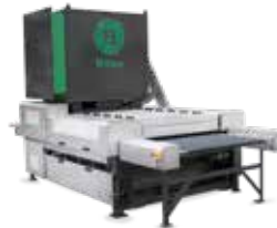
310/ Z Series Hybrid