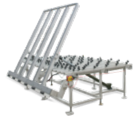
Tilting Caster Table