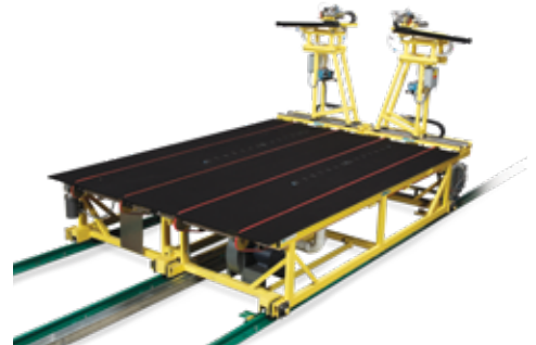
Automatic Free Fall