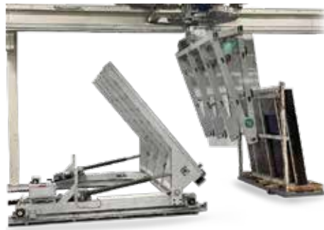
Crane Loading System