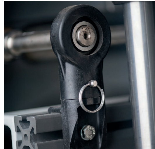
Quick Change Bearing Housing