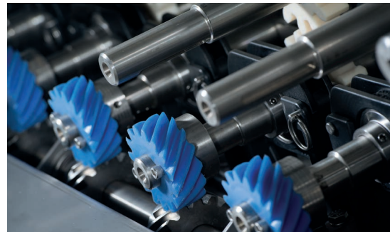
Helical Gear Conveyor Drive System